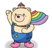
KG Rainbow Week Mascot Character Nijiro

*This program has been organized by the student group Cassis and Q-Losik.